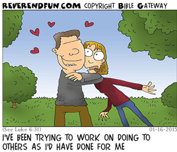
(See Luke 6:31) 01-16-2015